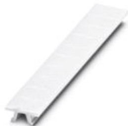
Zack marker strip, 10-section, horizontally labeled with the consecutive numbers: 51 ... 60, white, width: 6 mm

Please be informed that the data shown in this PDF Document is generated from our Online Catalog. Please find the complete data in the user's documentation. Our General Terms of Use for Downloads are valid ( http://phoenixcontact.com/download )